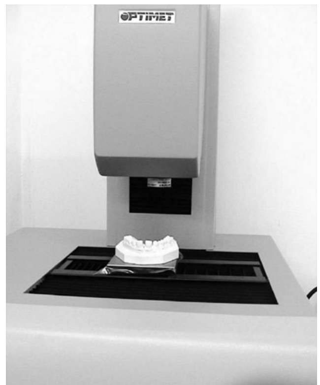
Fig. 1. Optimet 3D scanner with the 'ConoProbe' Holographic sensor.

The scanned data were processed and viewed with the 3D TELEDENT software developed especially for this research purpose by the Lab of computer graphics and CAD, Faculty of Mechanical Engineering, Technion, Haifa, Israel (12). Digital computerized measurements of the mesio-distal tooth width of permanent dentition were performed as follows: